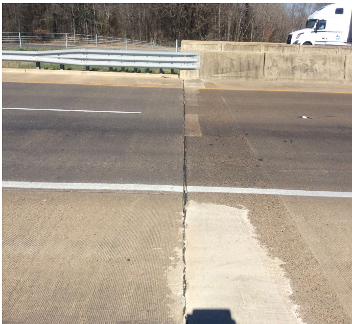
PHOTO 1 Description JOINTS AT BENTS 1 AND 8 . JOINTS NEED TO BE FILLED.