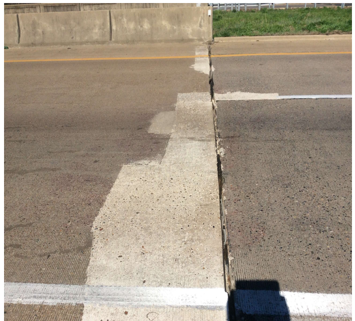
PHOTO 2 Description Joint material missing in joint 8. ....